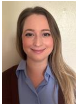
Director of Health Strategy